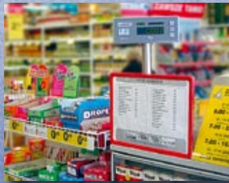
Well-visible display at a check-out terminal